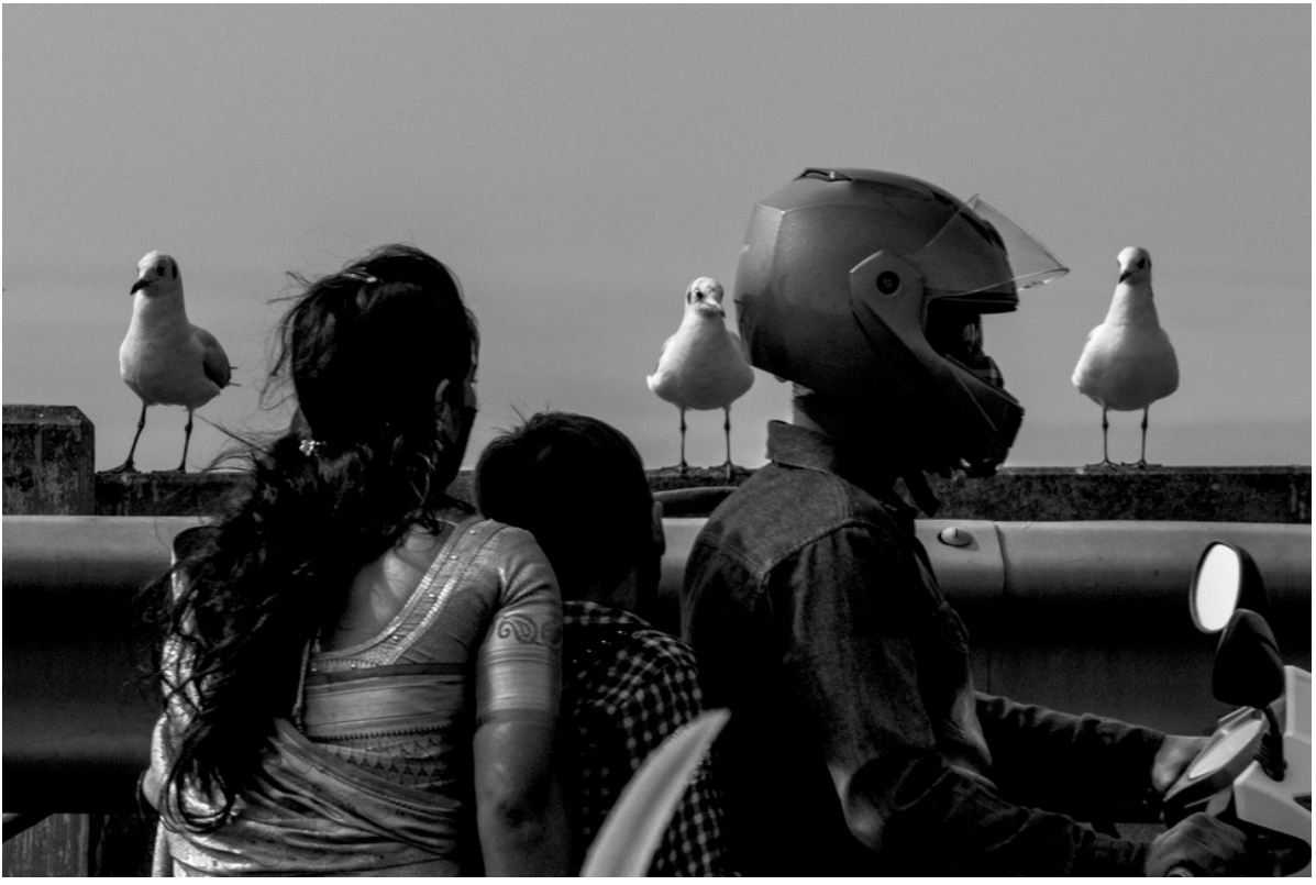
FREEDOM'S RIDE: THREE SOULS, THREE BIRDS