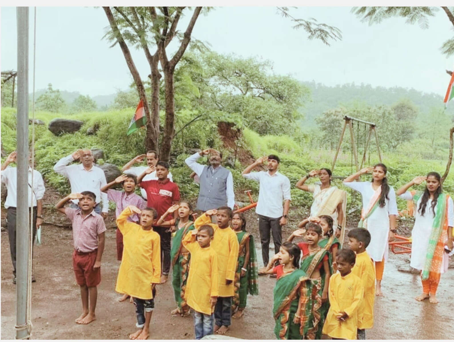
ndependence Day 2024 at Rotary Cente, Kunde Village